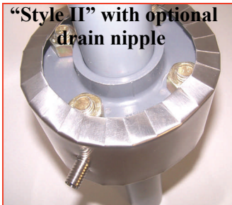
“Style II” with optional drain nipple