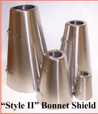
“Style II” Bonnet Shield