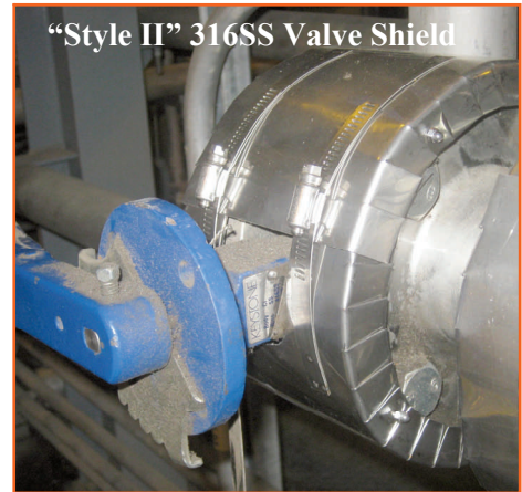
“Style II” 316SS Valve Shield